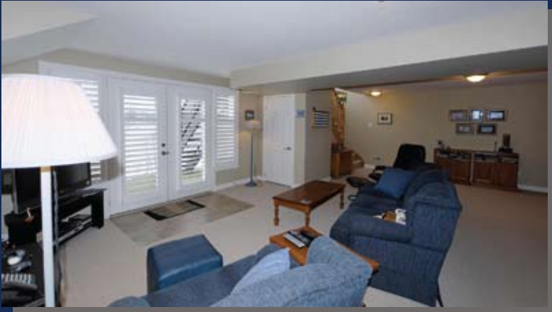
Lower level rec room, 3 piece bath, and 3rd bedroom/office.