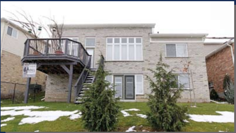
Walk-out basement to backyard overlooking greenspace/pond.