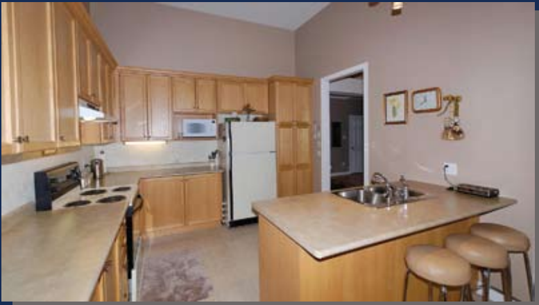
Beautiful maple kitchen with breakfast bar open to dinette.